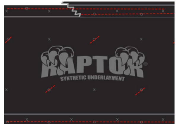
Recommended Stapling Pattern For Raptor