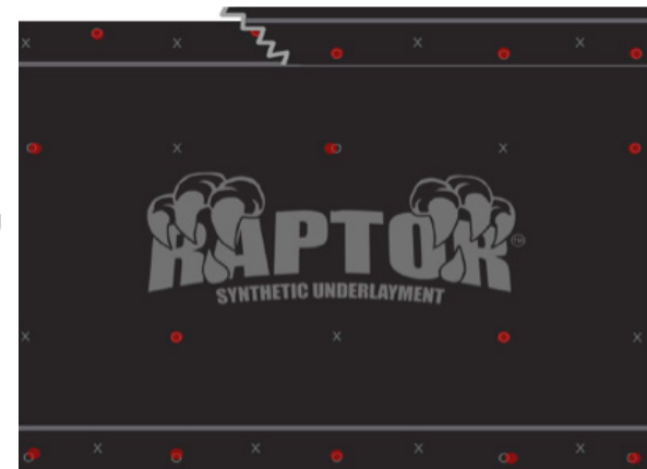
Nailing Pattern For Raptor In Normal Conditions