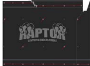
Recommended Stapling Pattern For Raptor Use as few staples as possible and must be covered with shingles the same day.

A continuous line of staples should be placed along the seams, with only a few staples in the field. Raptor's superior tear strength allows you to install Raptor using far fewer staples than you may have used with organic felt.