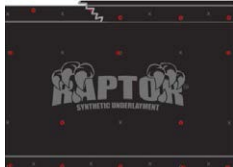
Nailing Pattern For Raptor In Normal Conditions Using Regular Roofing Nails or Cap Nails