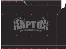
Recommended Stapling Pattern For Raptor Use as few staples as possible and cover same day with shingles.