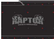
Nailing Pattern For Raptor In Normal Conditions Using Regular Roofing Nails or Cap Nails