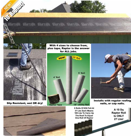
Raptor has an aggressive tear strength, reducing blow offs and allowing for fewer fasteners. Save Your Back, & Your Time!